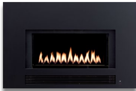
Flat Black Metal