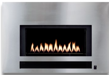
Flat Stainless Steel Metal