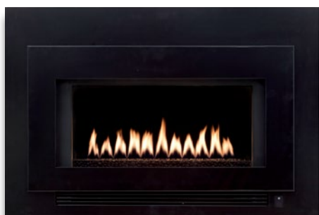
Black on Black