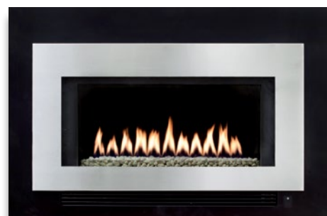
Stainless Steel on Black