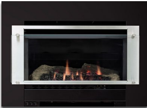
Stainless Steel on Black