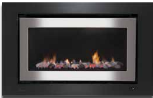
Stainless Steel on Black with Pebbles