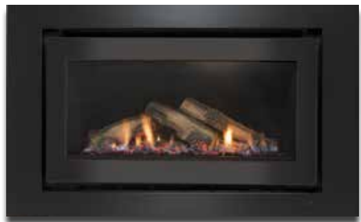
Black on Black with Australian Eucalyptus Logs