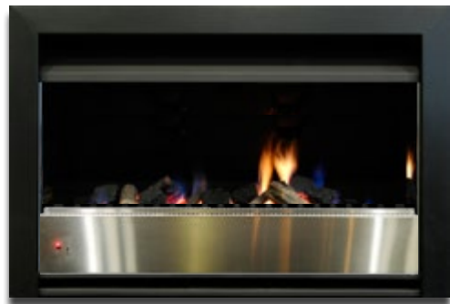
Black 3 sided trim