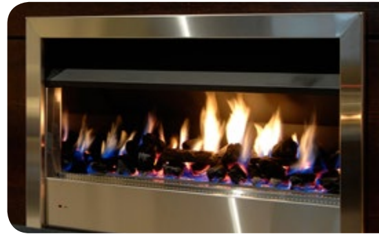
Side mirror reflector panels