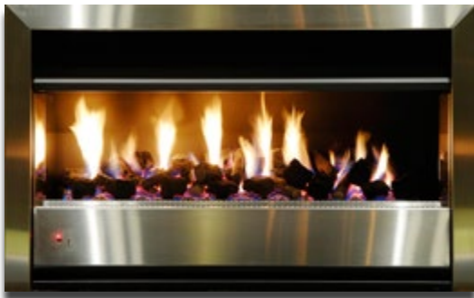
Stainless Steel 3 sided trim